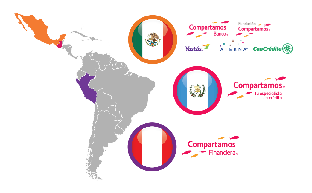
Figure 1. Our companies and their presence.

credits (ConCrédito), the design and operation of microinsurance (Aterna), and the development of solutions for financial inclusion through an innovation laboratory (Fiinlab). In addition, we have Fundación Compartamos, which inspires and encourages the social commitment of the group.