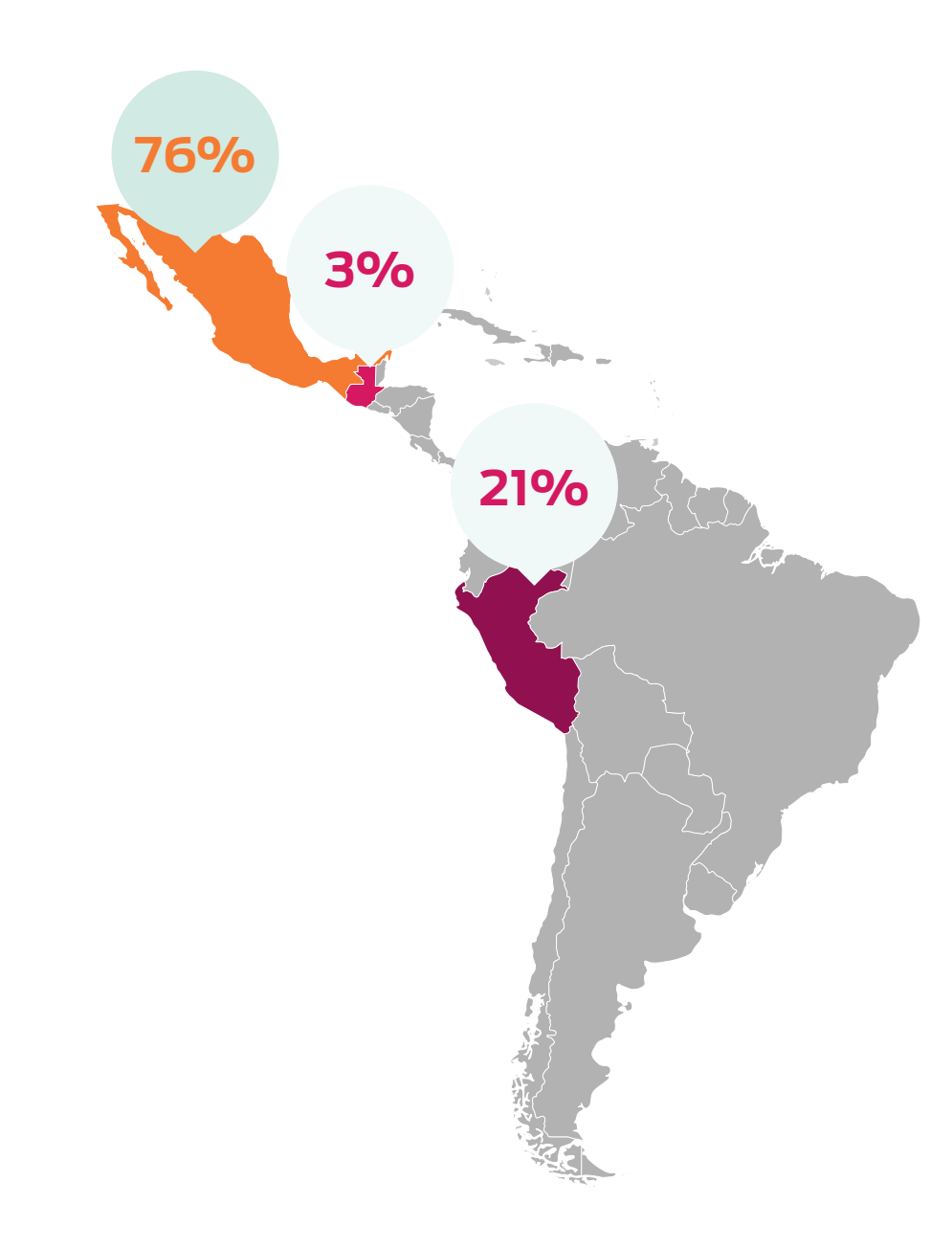
Figure 3. Percentage contribution of emissions by country.